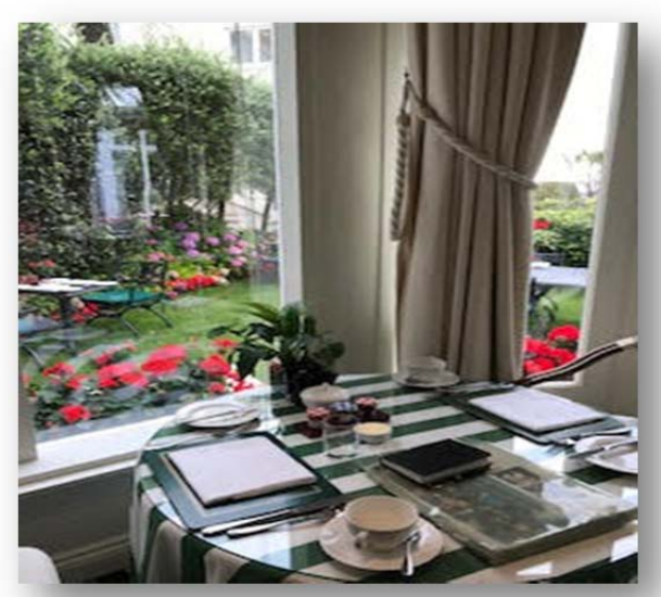
BREAKFAST AT OGH. GUERNSEY

DAY FOUR: Friday, September 21: You will start your day with a splendid English